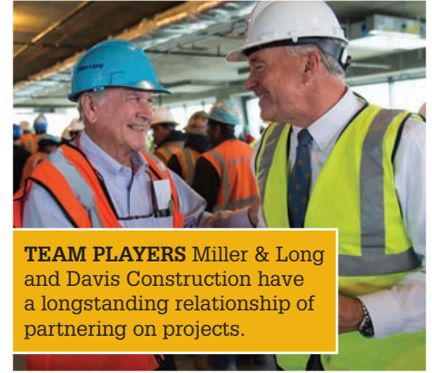
TEAM PLAYERS Miller & Long and Davis Construction have a longstanding relationship of partnering on projects.

As we look to 2017, one of our action goals is to get a seat at the table with the city’s mayor, Muriel Bowser. We have yet to do that. She is the first mayor that we have not been granted access to sit down with and discuss workforce development, career and technical education, and returning citizens – key issues for the JOBS Coalition and the District of Columbia. As underscored in a recent article of The Washington Post titled, “Is the D.C. Mayor Losing Control of Her City?” there is an increasingly tense relationship between Bowser and some members of the D.C. Council. The mayor could use our support on issues with which we agree. And a meeting would reveal those areas of agreement. I hope Ms. Bowser aspires for the end of her term to be fruitful and productive, and one embracing a collaborative spirit. □